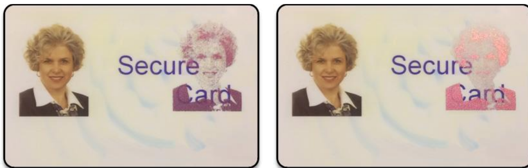
Figure 1: Optically variable personalization from a thermal transfer ribbon

Optically variable pigments can be used during the manufacture of the document 2 or they can be used to make a personalized security feature by utilising these pigments within a thermal transfer type ribbon 3 , as shown in figure 1 below.