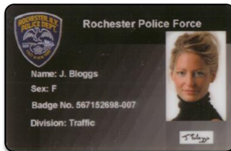
Figure 11: D2T2 and Unichroma™ Printed PC card

Unichroma™ + D2T2 printing is also an opportunity to add a colour photo as a secondary or primary image respectively on to PC cards alongside the other security features.