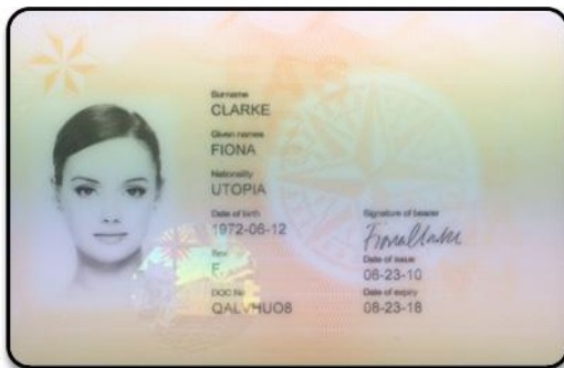
Figure 7: Security built in to the PC document

The market trend has therefore been instead to rely on security features within the PC document body. As an example, holographic features can be incorporated in to the body of a PC document (see figure 7) and this type of feature is in wide use in a number of high profile ID documents today.