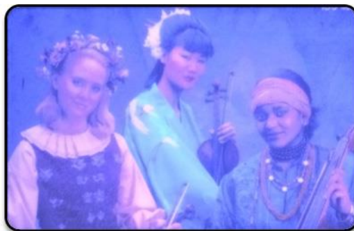
Figure 6: Card under UV-A light with full colour image