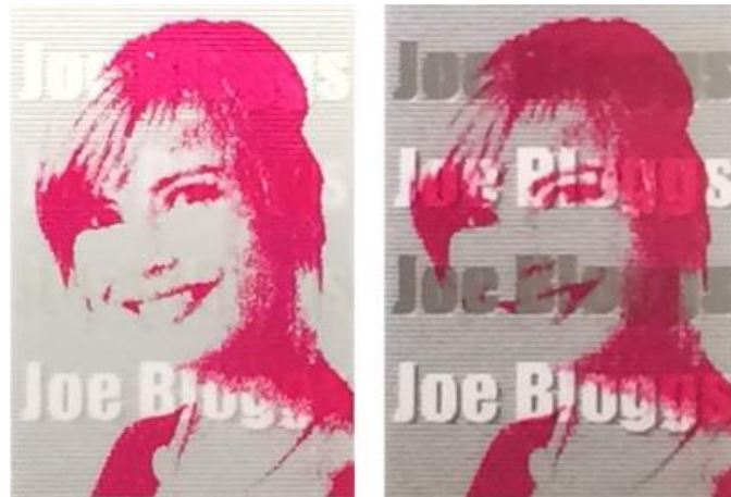
Figure 2: ITW Security Division's unique personalized optically variable effect varies according to the angle of view

As an example, the image shown in figure 2 below demonstrates a simple effect whereby the personalized face image is either in front of or behind the personalized lettering, depending on the angle of view.