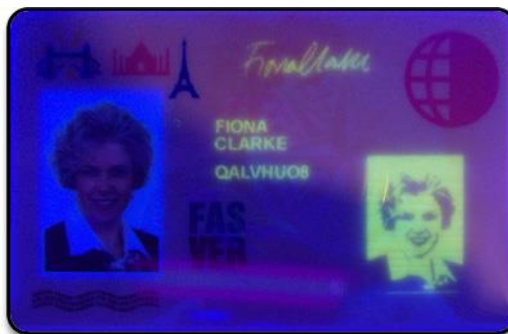
Figure 4: Personalized UV print on a PC card with Unichroma