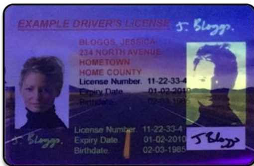
Figure 3: Personalized UV print on a PVC card

Therefore, non-blue UV-A features are more desirable and an example of a yellow UV-A personalized image printed with a transfer ribbon in combination with Dye diffusion thermal transfer (D2T2) printing on a PVC card is shown below in figure 3 and an example of the use of the same yellow UV ribbon in combination with Unichroma + D2T2 printing (see Polycarbonate section below) on to a PC card is shown in figure 4.