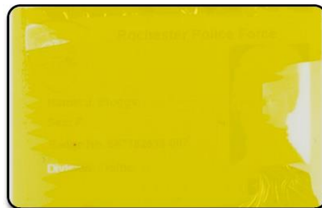
Figure 10: D2T2 Printed PC card