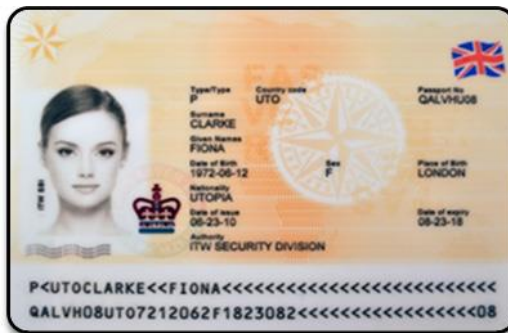
Figure 8: PC Protek™ incorporates security into PC

Further security within the body of a PC card or document can also be achieved through the use of ITW Security Division's new innovation of PC Protek™ - enabling highly secure printed features to be incorporated into the body of a PC document. Figure 8 shows how PC Protek™ features such as metallic, OVTek™ and thermochromic can all be incorporated into a PC datapage. OVTek™ and thermochromic features not only offer a secure level 1 feature but they